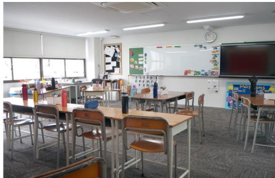
Year Five Classroom